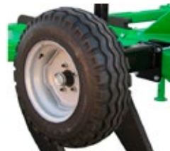
Increase pneumatic wheel (10,0/75-15,3")