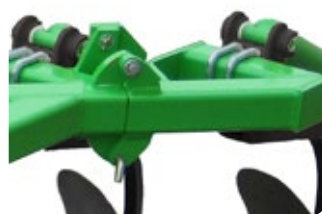
Increase by manual folding