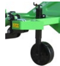
2nd metal wheel increase