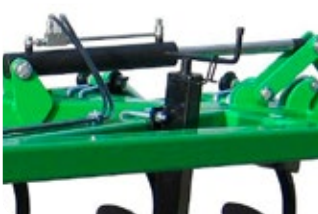
Increase by hydraulic folding