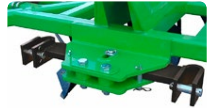
Swing hitch detail