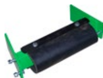
Kit to guide to the trunk for RT 65 P