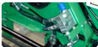
Flow regulation kit for the unloading endless screw RT 65

*Only for tractor with oil flow superior to 60 L/m that cannot be regulated.