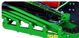
Increment per bass umbrella for RT 65