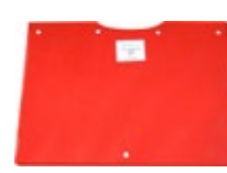
Replacement of the standard skirt by soft skirt in equipment RT 65 P