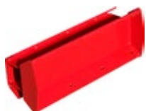
Deck support increment mounted for RT 65 P