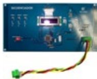
Sequencer harvester (recolect. de almendra)