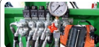
Tightening vibrating head adjustment kit RT 65