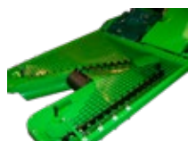
T65 mesh kit for olive