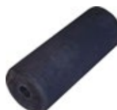
Replacement of standard mallets by mallets with soft clamp in RT 65 P