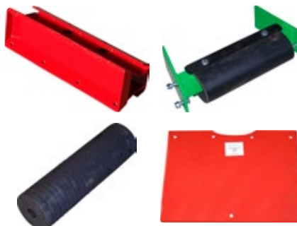
Kit "young olive trees" for RT 65 P