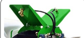
"V" deflector for Levante air fans