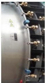
Arc jets kit with nozzle holder for Levante model