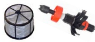
Powder mixer in tank mouth