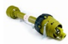
Price diff. for homocinetic transmission