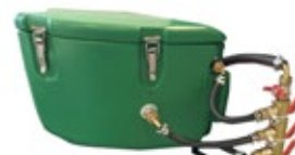
Product mixing tank (integrated)