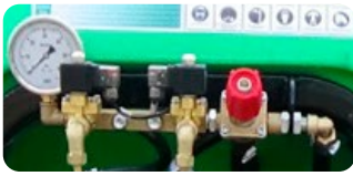
Price diff. for electrical control 2 way with download