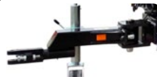
Price diff. for approved direct directional launch