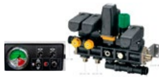
Price diff. electrical control increase 2-way with volumetrics