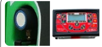
Sonar for atomizer