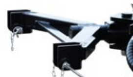
Price diff. for approved V-directional launch