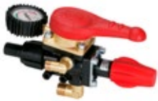
Price diff. for Alfa control (GHR) ready for sonar