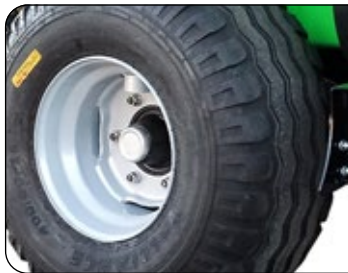
Price diff. for wheels