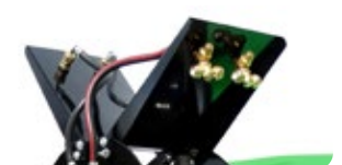
"V" deflector with 2 jets on each side for Ciclon air fan