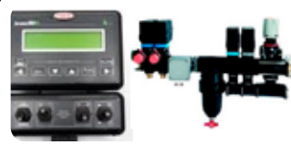
Price diff. for Bravo 180S 2 ways with Orion flow meter